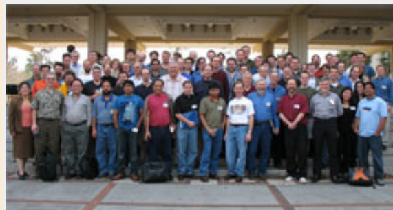
The OSG Consortium at January's meeting. (Click on image for larger version.)

In January, the OSG Council elected the first Executive Director and Council Chair, who appointed the remaining members of the Executive Team and Executive Board to their first term. The OSG Executive Team is responsible for all aspects of the OSG program of work—deliverables, milestones, activities and finances. The Team includes the Executive Director, Facility, Application and EOT Coordinators and Resource Managers. The OSG Executive Board, which includes the Executive Team, directs the OSG program of work, draws up policies and represents the OSG Consortium in dealing with other organizations, communities and committees.